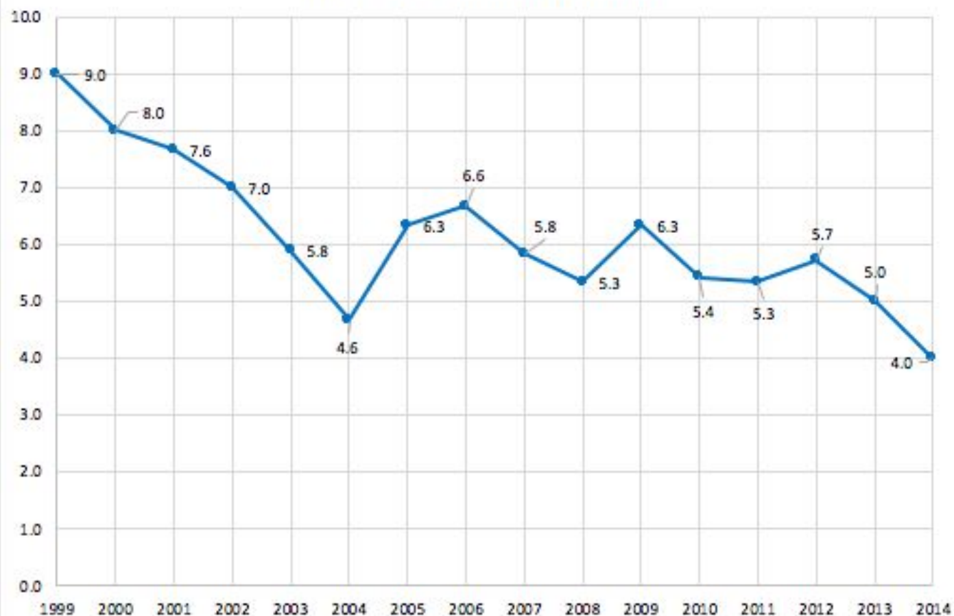
Avg Time to PhD By Year of Entry